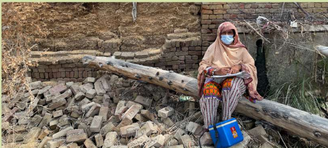
A health worker sits outside her own house after the floods severely damaged her home in Fatehpur in Rajanpur district, Punjab. She assisted at health camps following the floods and was vaccinating children in her community a month after the rains ravaged Rajanpur district.

The year 2022 started with cautious optimism. For the first time in its history, Pakistan marked a year without a child infected with the poliovirus. It was a momentous time for the Polio Eradication Initiative but one that the program was nervous about. With evidence of continued wild poliovirus circulation in the six districts of southern Khyber-Pakhtunkhwa (KP), our fears were realized when a 15-month-old child was paralyzed in North Waziristan last April in the first polio case of 2022 and the first in the country in nearly 15 months.